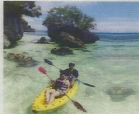
RENT-A-KAYAK PADDLE ALONG ALONA COAST & DISCOVER HIDDEN COVES