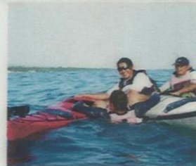
LEARN SEA-KAYAKING RECREATIONAL KAYAKING COURSE