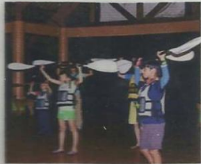
FUN W/ KAYAKING KAYAK ORIENTATION PROGRAMS