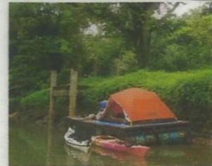
KAYAK-CAMPING TRIPS KAYAK & CAMP ON A DESERTED ISLAND OR ALONG TRANQUIL RIVERS