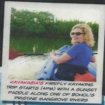
KAYAKASIA'S FIREFLY KAYAKING TRIP STARTS (4PM) WITH A SUNSET PADDLE ALONG ONE OF BOHOL'S PRISTINE MANGROVE RIVERS