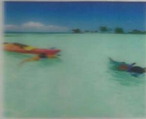
KAYAK & SNORKEL MAKE YOUR WAY TO NEARBY REEFS & SNORKEL OVER CORAL FORMATIONS